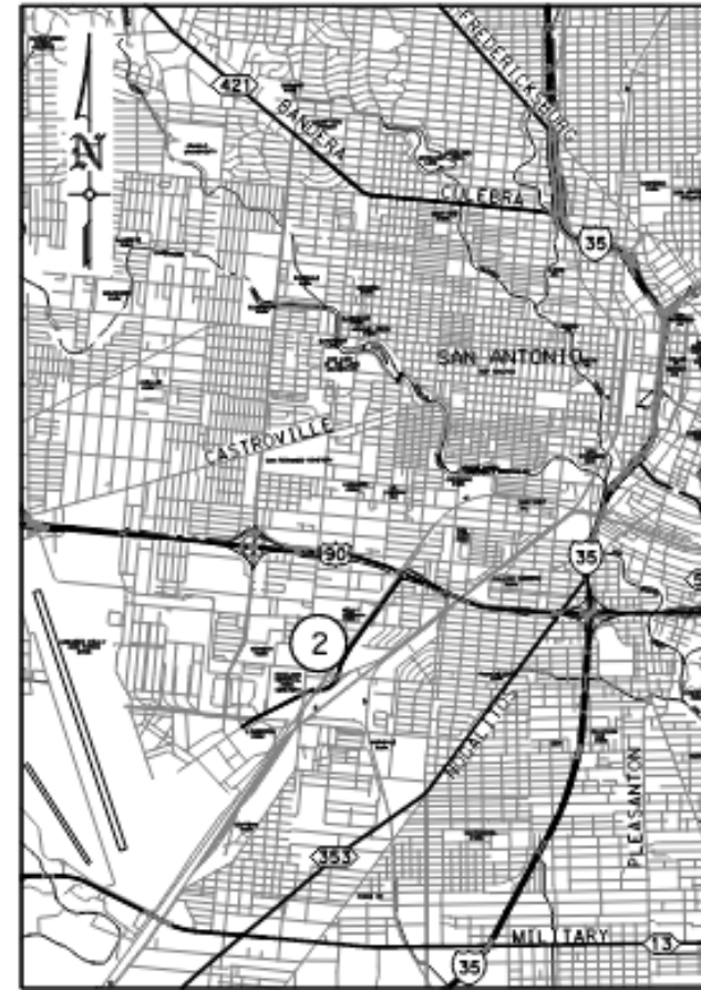
SITE LOCATION MAPS